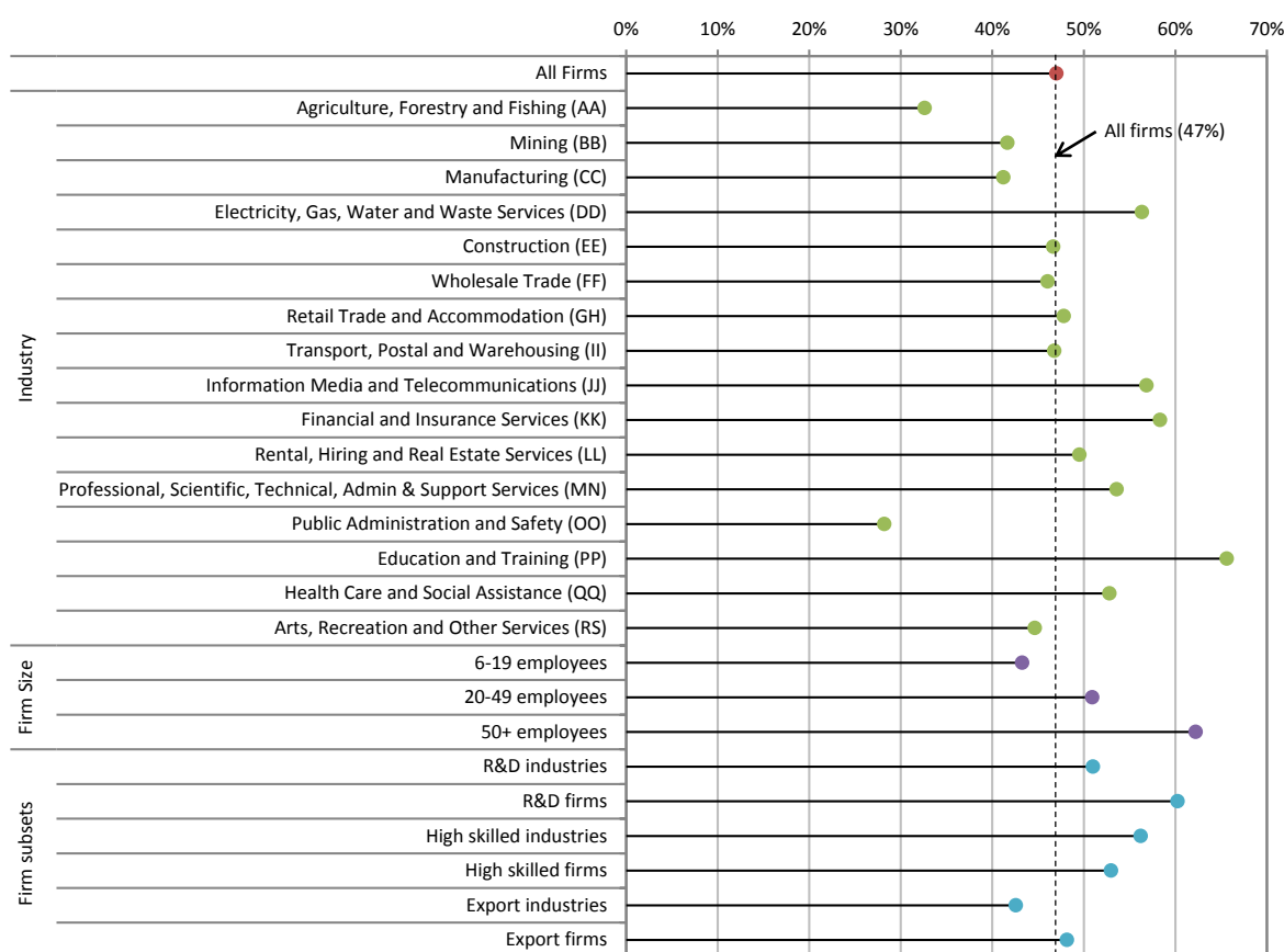
Figure 3.2 Percentage of innovating firms indicating new staff are an important source of new ideas for innovation, pooled years

Finally, we looked at whether firms had entered a new export market in the past year